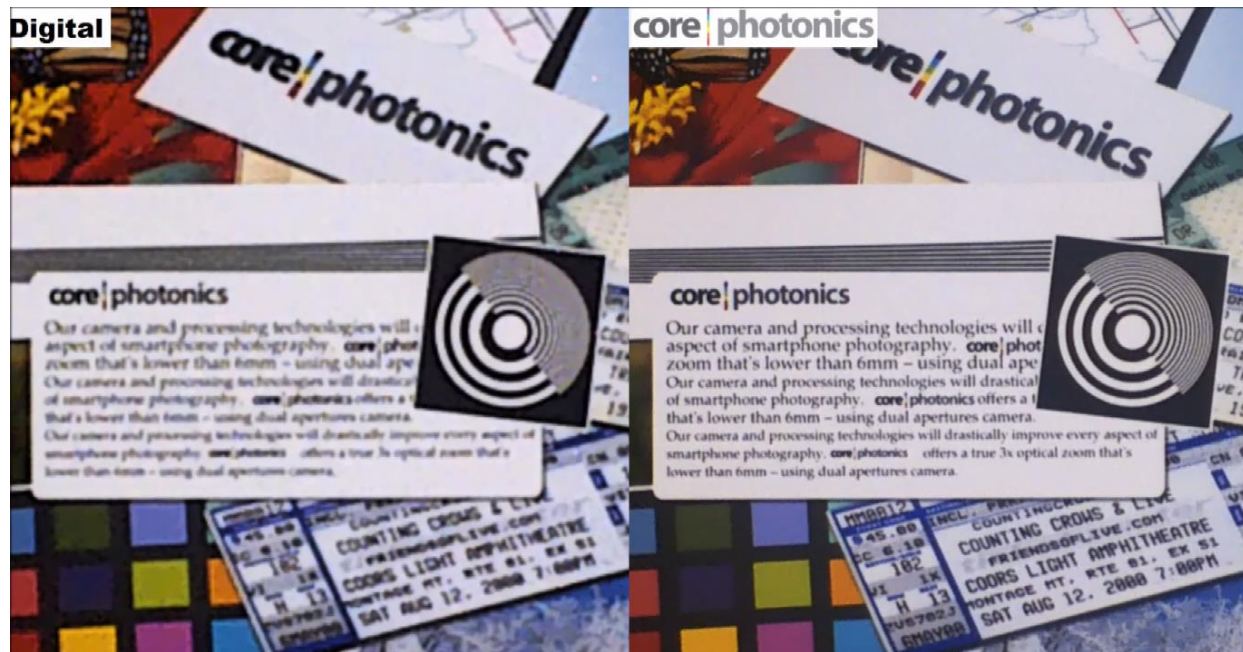
Figure 6: Digital zoom (left) vs. Dual aperture optical zoom (right)

Furthermore, instead of recovering loss of resolution, we were looking for ways to further increase the effective resolution (compared with single aperture cameras) at the center of the field of view and by that obtain zooming functionality. Hence, we further designed and analyzed dual aperture systems in which the two apertures have different optics, which comply with predefined height constriction, and obtained a true continuous optical zoom with high SNR and resolution across the entire zoom range. Preliminary results are seen in Figure 6 and demonstrate the potential of this approach.