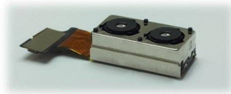
Figure 3: Dual-aperture camera

Assuming the total number of pixels (or sensor area) in an imaging system is fixed the analysis in the previous section led us to research dual aperture imaging systems, such as the one shown in Figure 3.