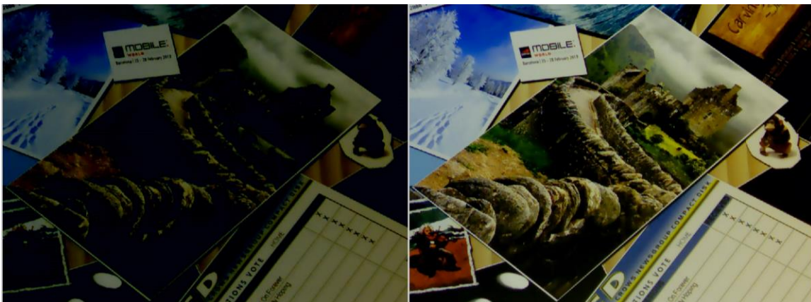
Figure 5: Low-light scene – single aperture (left) and dual-aperture (right)

Compared with a single aperture Bayer camera, such variants of dual-aperture camera can result in high effective resolution and one Exposure Value (EV) difference in noise performance as seen in Figure 5.